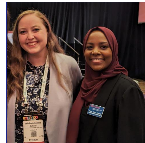
Fellows play a leading role in policy-relevant research projects and communication initiatives.